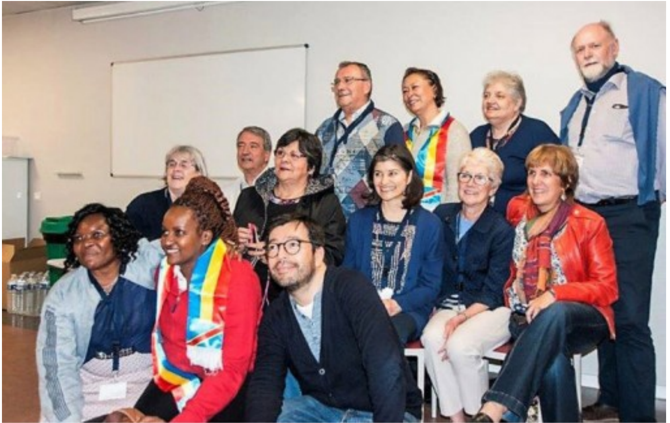
Team of lay people, engaged in the Assumption, invited to the General Chapter